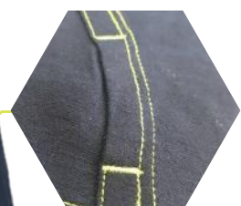
Thumb hole in cuff for extra warmth