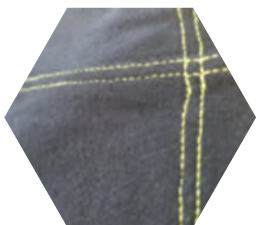
Double stitching for longevity