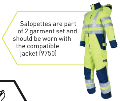
Salopettes are part of 2 garment set and should be worn with the compatible jacket (9750)