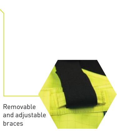
Removable and adjustable braces

COLOUR: HV Yellow / Navy FABRIC SPECIFICATION: Outer Layer: VXS+ Inherent Special Weave Fabric with Waterproof Membrane - 395gms Lining Layer: VXS+ Inherent Woven Fabric - 200gms LOI: 27.0% PRODUCT CARE: